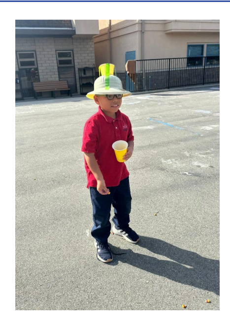
K-2nd Grade Classroom