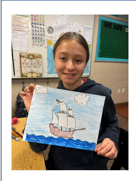
3rd-5th Grade Classroom